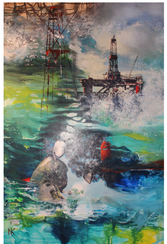
The sea is your mirror, 2015, 108 x 73cm, © ADAGP

Nicole King is a Board member of the Salon d'Automne.