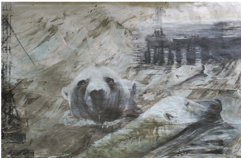
Polar bears on borrowed time, 2020, 81 x 116 cm ©ADAGP